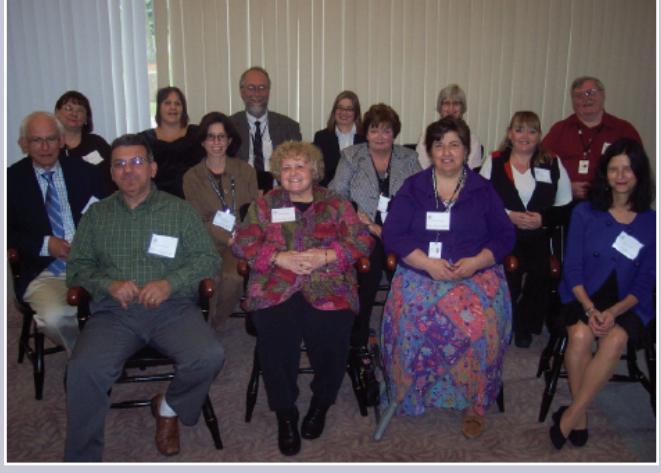
Twenty-five year recipients pose in their McLean chairs.